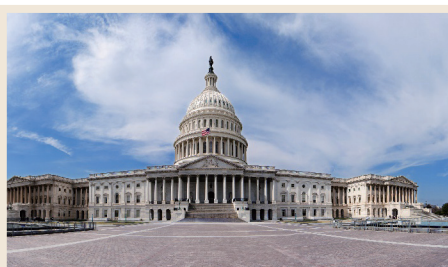
The United States Capitol building

We must admit that the U.S. and the entire free world are facing dire crises: declining economies, waning industries, diminishing technological development, soaring crime rates, weakened militaries, and decaying national values. People are overwhelmed